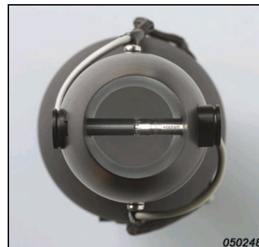
Fig. 1 Left: Top-view of Volume Velocity Adaptor showing phase-matched microphone arrangement. Right: Side-view of adaptor

The output volume velocity can be automatically calculated using Volume Velocity Measurement Type 7784 software, which estimates the volume velocity based on the sound pressure levels measured in the adaptor (using a plane wave model). A source to response FRF is then calculated using the measured response signal and the estimated volume velocity.